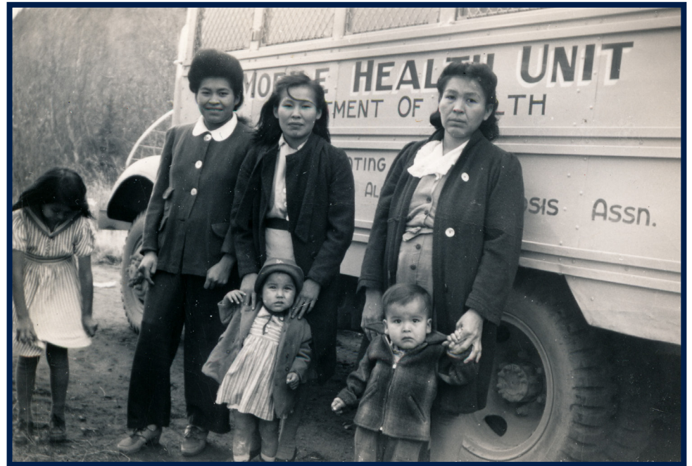
Title: Patients and health personnel beside Mobile Health Unit, ca. late 1940's.