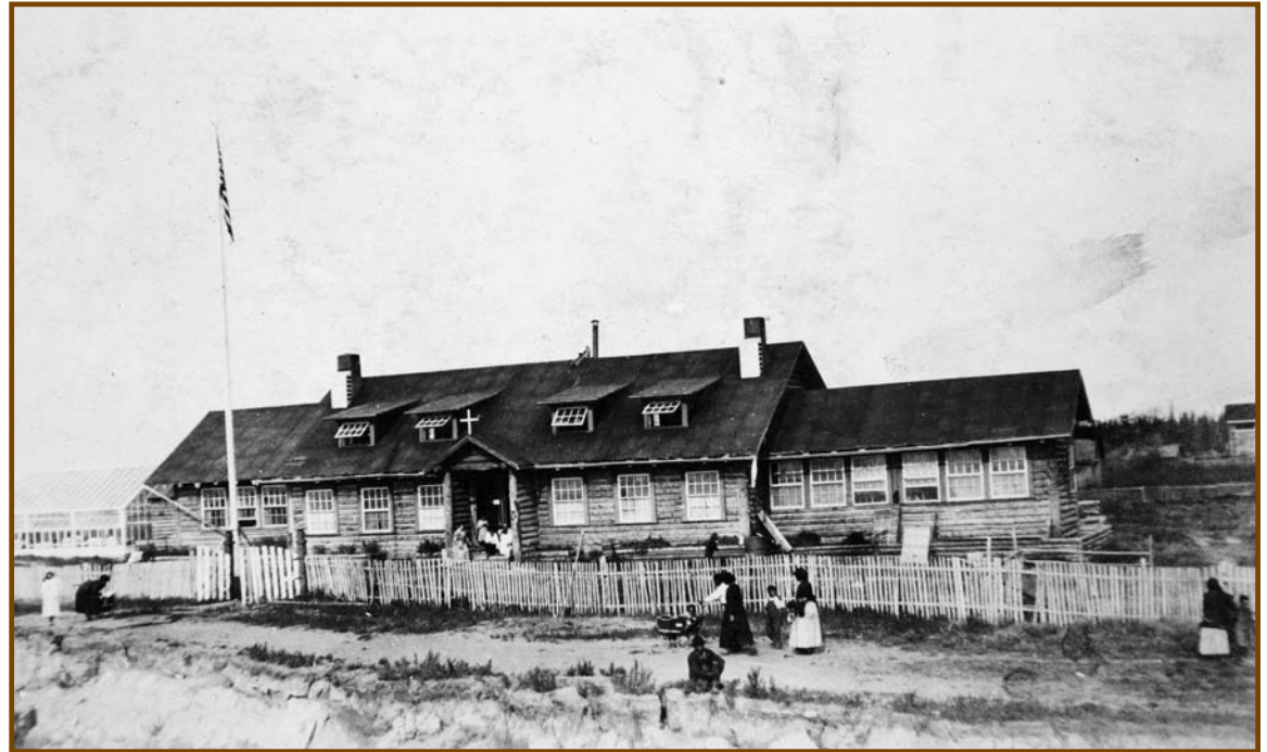
UAF-2003-109-35: Hospital, Fort Yukon.