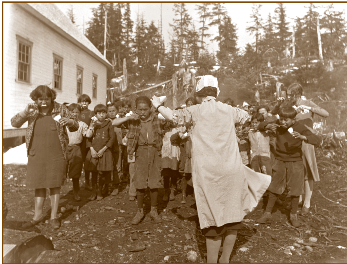
ASL-P55-395: Brushing teeth, Mission School, Yakutat, Alaska.