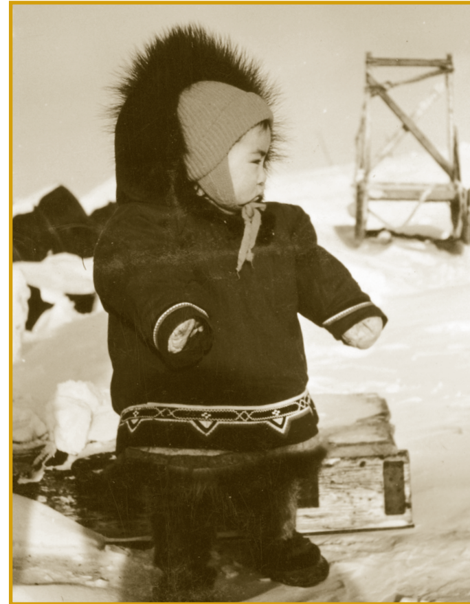
Alaska State Library, Alaska Dept. of Health & Social Services Photograph Collection, P143-1077