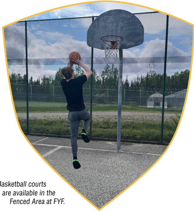
Basketball courts are available in the Fenced Area at FYF.