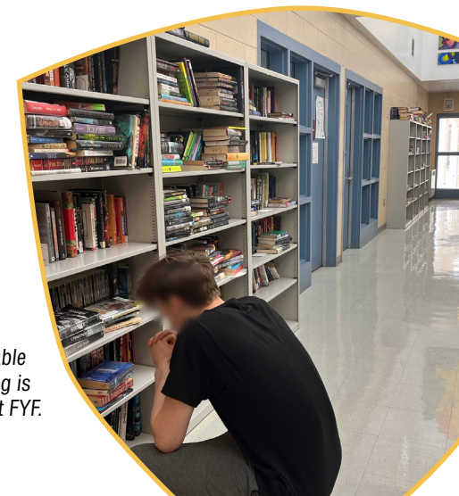
A library is available and reading is encouraged at FYF.

At FYF, resident safety and security are our top priorities. Residents are encouraged to report any unsafe situations to staff, who will handle concerns with respect and confidentiality. Residents must treat others with respect, and any threatening or violent behavior is prohibited. If issues are not resolved through regular communication, residents can use the formal grievance process.