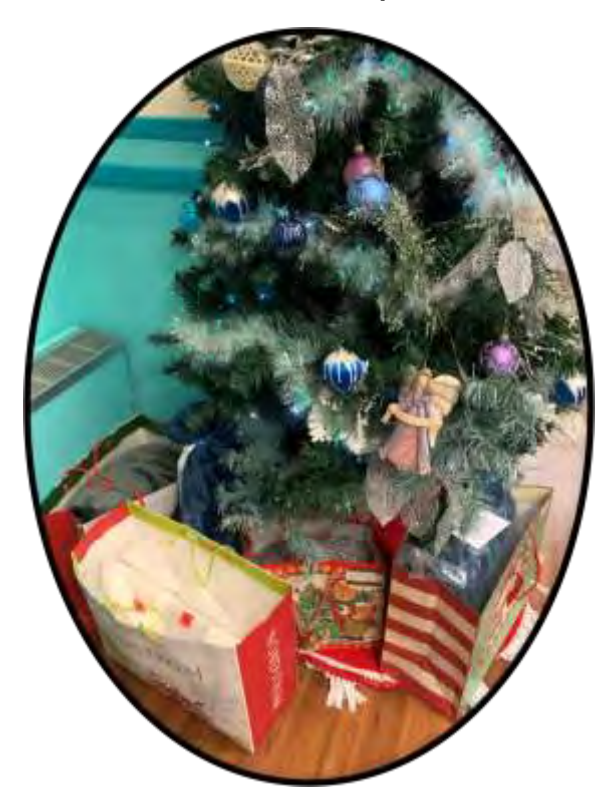
Ocean View Tree