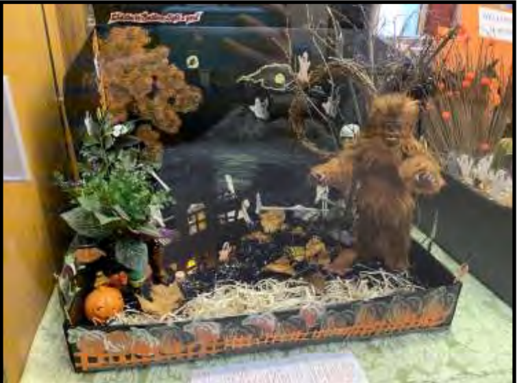
Most spooky... Ocean View!