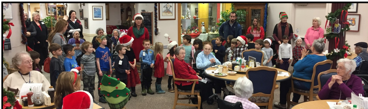
Baranof kids caroling (left).