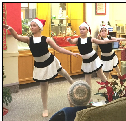
Sitka Studio of Dance performers at the Christmas Party