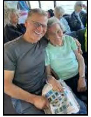
A sightseeing cruise, lunch, Bingo, sunshine & friends...what more could you ask for?