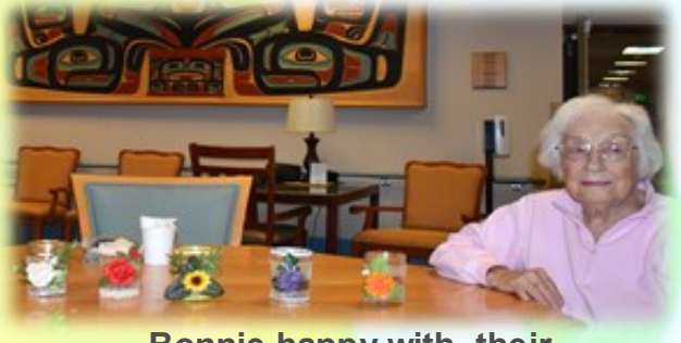
Bonnie happy with their mason jar candle holder