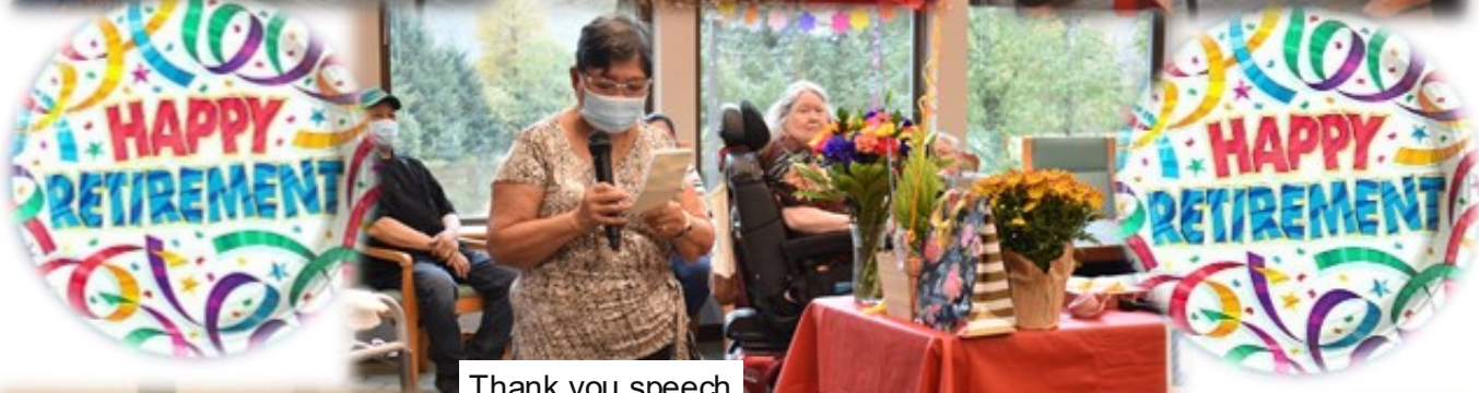
Thank you speech