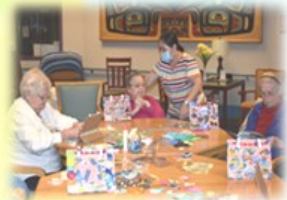
The making of "Best of Alaska" Photo Frames