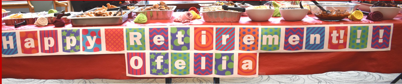
Ofelia Talaoc retires after 15 years in Food Service.